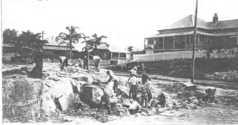
Relief workers digging the rock from the Hawthorne Street side of the school grounds in the 1930s.

lift operators, invariably veterans who had lost an arm or a leg. On Arbor Day we planted a tree, usually a native which, almost without fail, died in our stony playground in spite of the efforts of monitors to water them. Monitors were pupils given positions of responsibility to carry out such tasks as washing out inkwells, putting out books for certain periods, cleaning the blackboard and making sure the teacher had chalk etc.