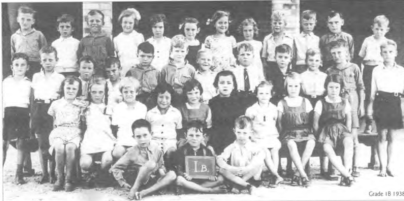
Grade 1B 1938.