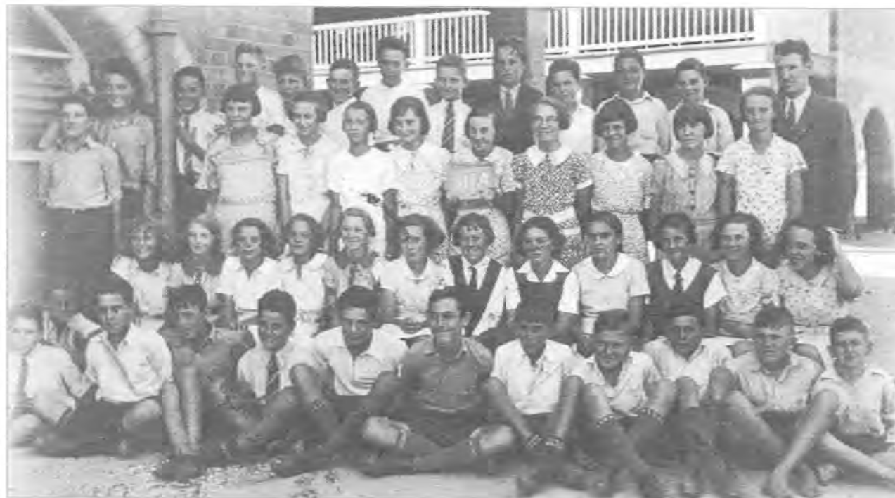
1901 NEW FARM STATE SCHOOL 2001