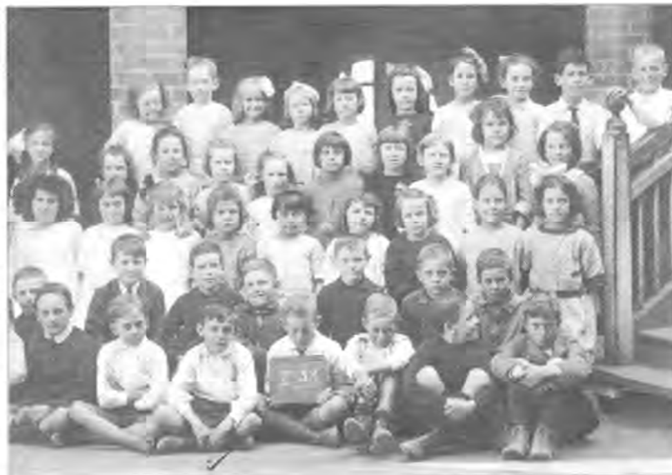
Grades II and 3A 1922.