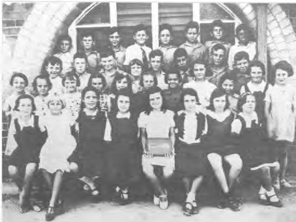
Grade IV 1939.