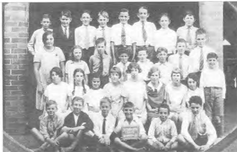
Scholarship Class 1928.

The bad days of the depression when school friends took food from the rubbish bins. The men leveling the top playground using only hand tools to remove the rock. Arguments between boys were settled by fights in the Methodist church grounds because it was the only grassed area available.