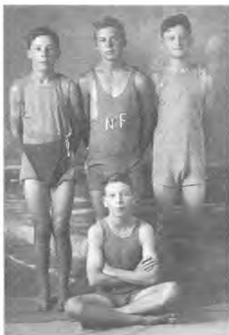
Swimming Team 1925.