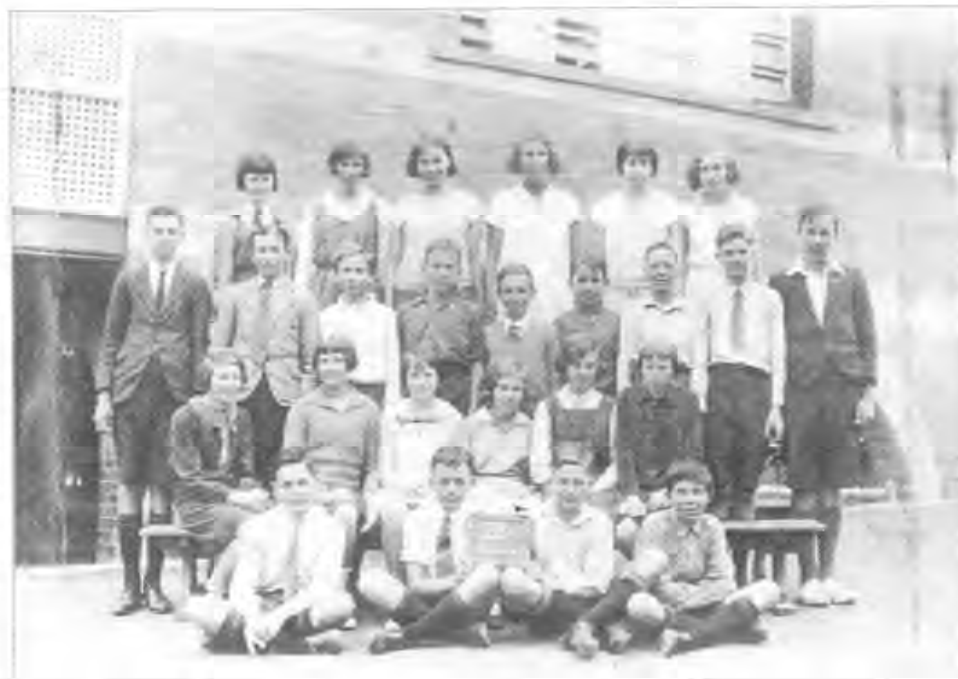
Grade VIIA Scholarship 1930.

with white apron from neck to ankles. He cut his great cheeses with a wire and broomstick handle. The butter came in 56lb butter boxes made of timber. Then a grid was passed through the butter cutting it into 1 or ½ pound sections. The whole place smelt of newly cut ham, cocoa, coffee and tea and the floor was covered with sawdust (so was the butchers) a regulation of the time.