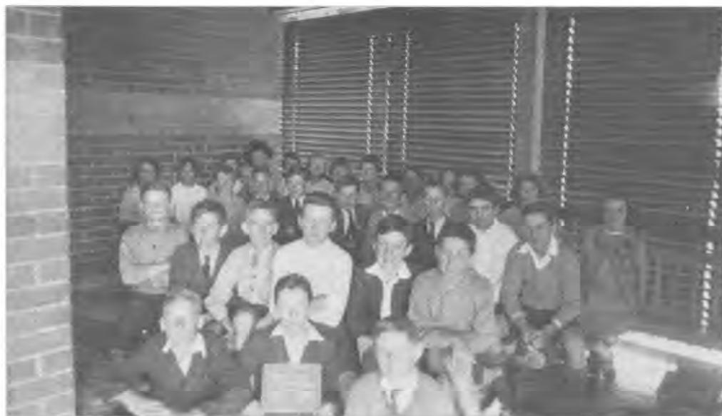
Verandahs were used as classrooms throughout the early decades.