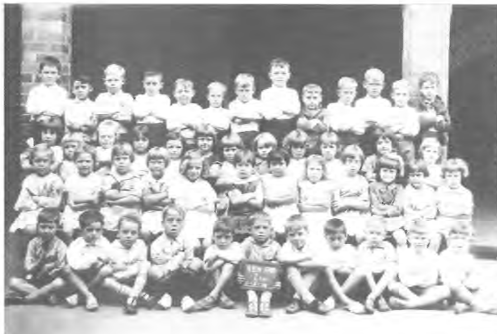
Grade I (1a) 1929.