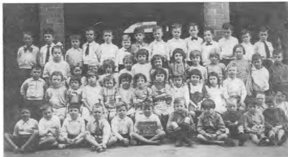
Grade 1 (2) 1924.