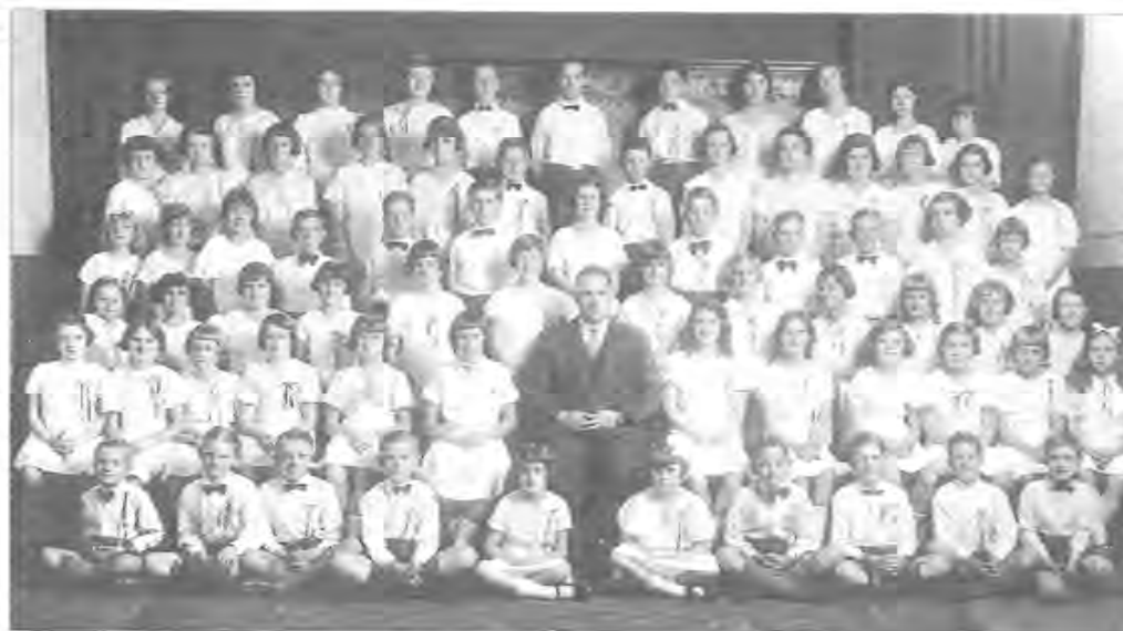
New Farm State School Combined Senior and Junior Choirs, Winners Own Choice Choral Competition, Semi-Finalists Chief Choral and Unison Competitions. Queensland State Schools Eisteddfod, 1934.